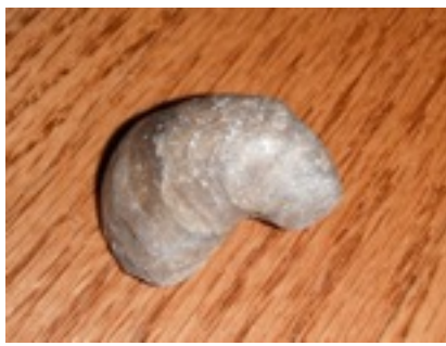
Shells – Utah