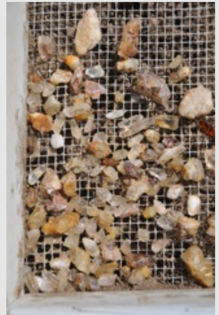
Quartz — Montana

*Please note that the Calgary Rock and Lapidary Club is not advertising / sponsoring these venues, but sharing places for all rock lovers.