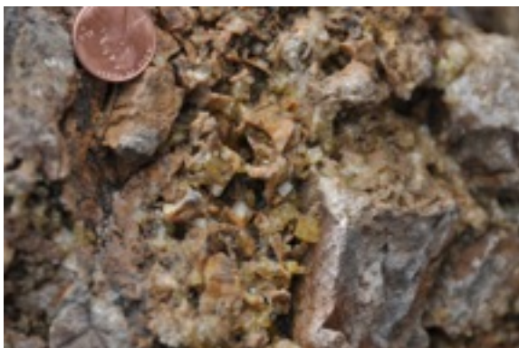
Barite — Montana