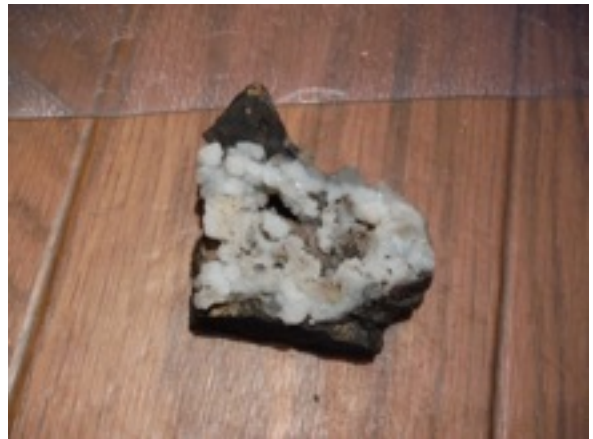
Angel Wing Quartz — Stettler