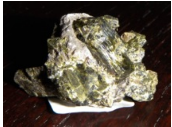
Epidote — Calvert Mine