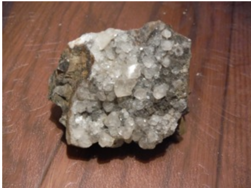
Calcite — Lethbridge

Fossils, Garnets, Amber, Selenite, Calcite, Quartz