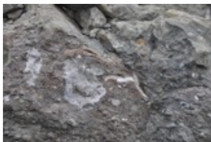
Fossilized Oysters — BC