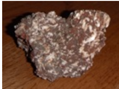
Dolomite — BC